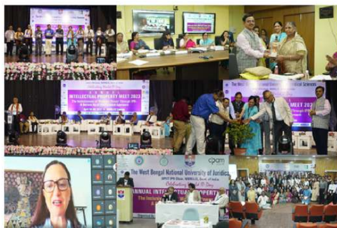
WBNUJS IP MEET 2023