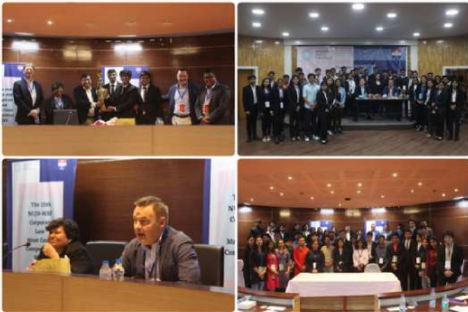
THE 15TH NUJS-HSF MOOT COURT COMPETITION