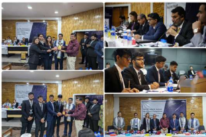
THE 21ST JOHN H. JACKSON MOOT COURT COMPETITION/ WEST AND SOUTH ASIA REGIONAL ROUND