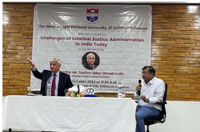
SEMINAR LECTURE BY HON'BLE MR. JUSTICE UDAY UMESH LALIT, FORMER CHIEF JUSTICE OF INDIA