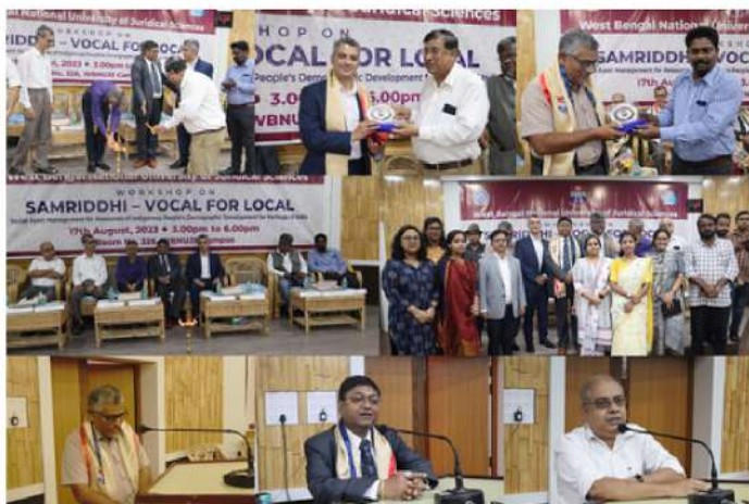
WORKSHOP ON SOCIAL ASSET MANAGEMENT FOR RESOURCES OF INDIGENOUS PEOPLE'S DEMOGRAPHIC DEVELOPMENT FOR HERITAGE OF INDIA (SAMRIDDDHI- VOCAL FOR LOCAL)