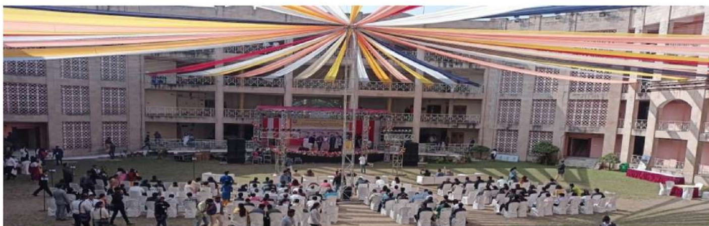
43rd ALL INDIA CRIMINOLOGY CONFERENCE