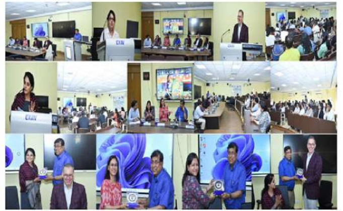
WORKSHOP ON WOMEN AND IP: ACCELERATING INNOVATION AND CREATIVITY