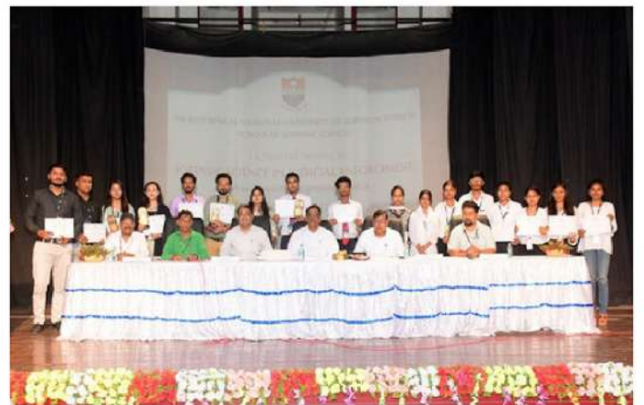
FORENSIC SCIENCE IN JUDICIAL ENFORCEMENT: A WAY TOWARDS PROGRESSIVE JUSTICE