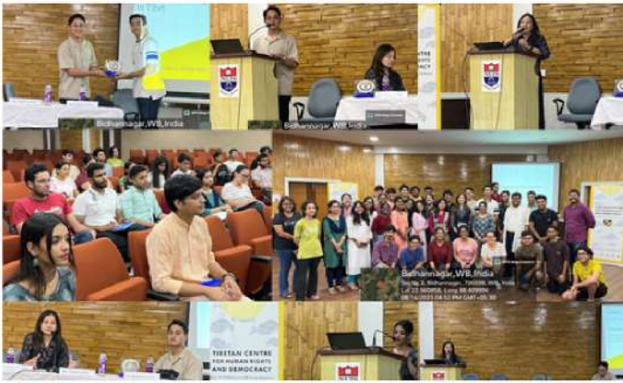
THE VISIT OF TIBETAN CENTRE FOR HUMAN RIGHTS AND DEMOCRACY