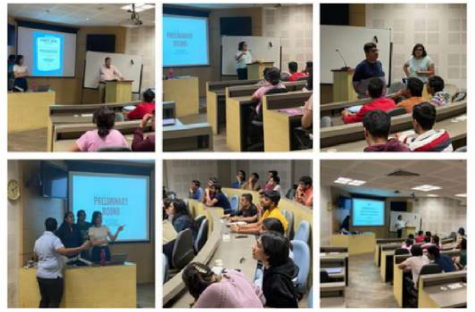
CONSTITUTION DAY OR "SAMVIDHAN DIVAS" OF INDIA